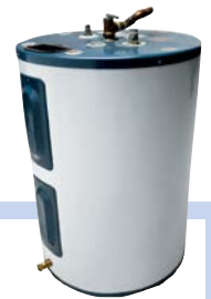
Retail Repair or Replacement Costs (without a Real Estate One Home Warranty)

Plan for Peace of Mind A Real Estate One Home Warranty provides assurance that you won't have to worry when a covered appliance or system breaks down, and that you will be provided with a repair professional you can trust.